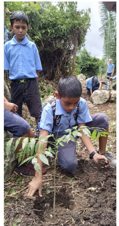
Nature Conservancy Day 2023

At our Institute of Archaeology we continue our professional management and safeguarding of 14 Parks which spans some 29,377 acres. Our partnership with our sister institution BTB remains strong and energetic. Belize's tour guides, operators, and artisans continue to welcome with world class service thousands of tourists.