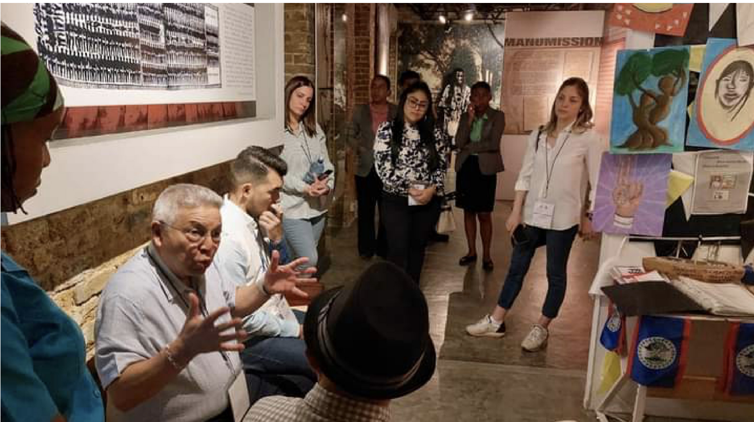
Last year we saw an increase in community cultural and historical programs originating from our Museum of Belize and Houses of Culture. This network of cultural spaces include Houses of Culture in Benque Viejo del Carmen, Corozal Town, Orange Walk Town, and Belize City.