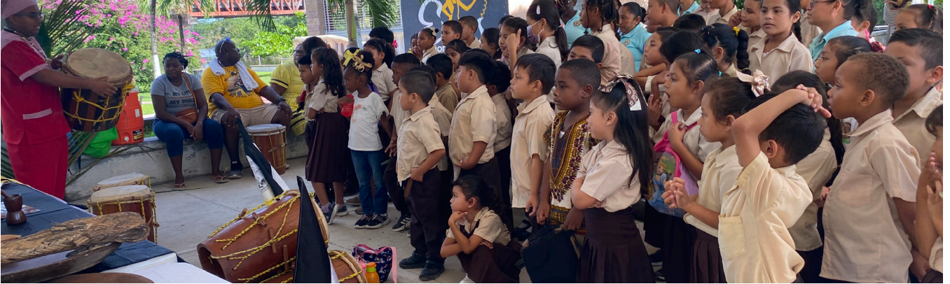
Garifuna Settlement Day Celebration, Banquitas House of Culture, Orange Walk Town, November, 2023