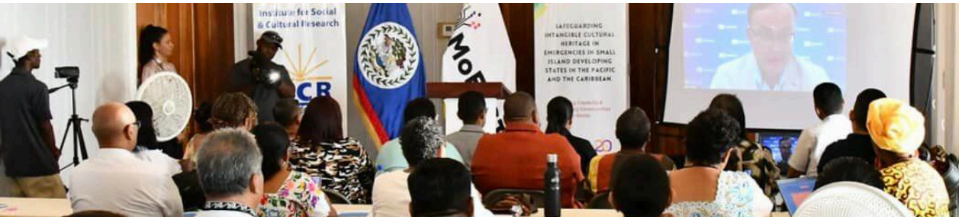
UNSECO Intangible and Cultural Heritage workshop July 2023

It must also be noted that NICH gave significant financial support to a wide range of creative groups and individuals all across Belize. We see this as grassroots sparks of progress. When we invest in people we lay the groundwork for cultural development.