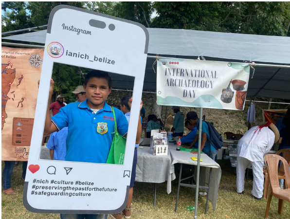
International Archaeology Day, October 21 is a worldwide celebration of the contributions of archaeology to the global community. The IA hosted a site fair at Lamanai in 2023.