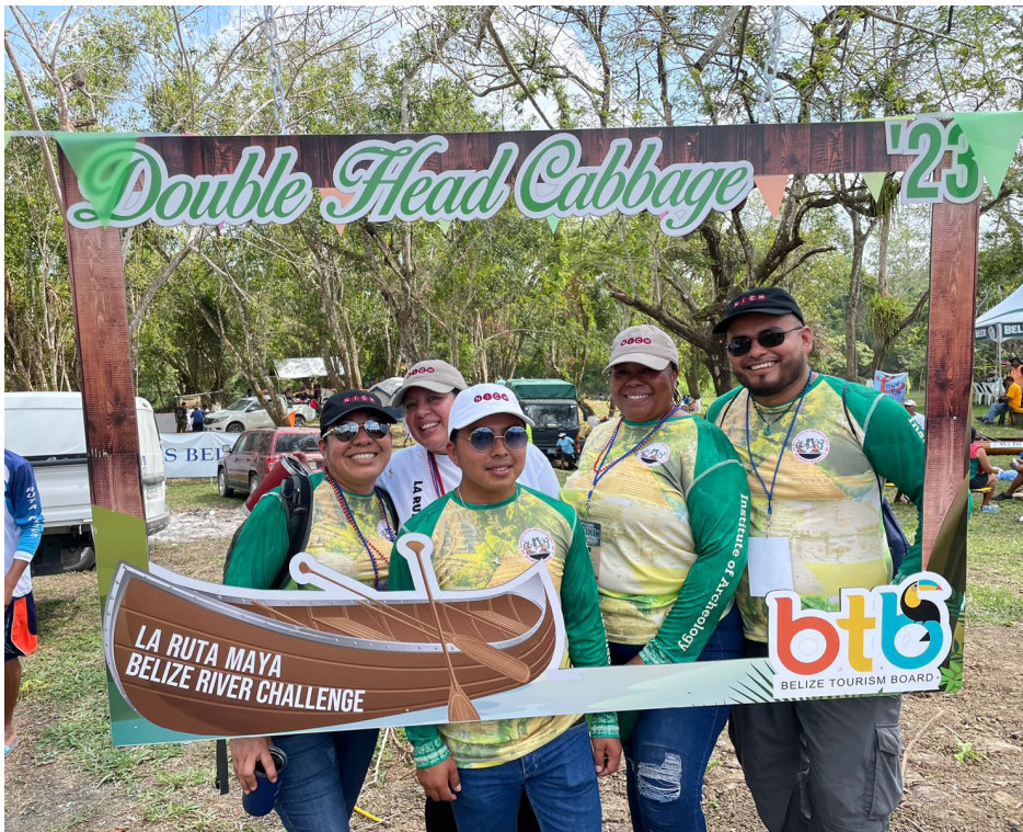
Ruta Maya, March 2023