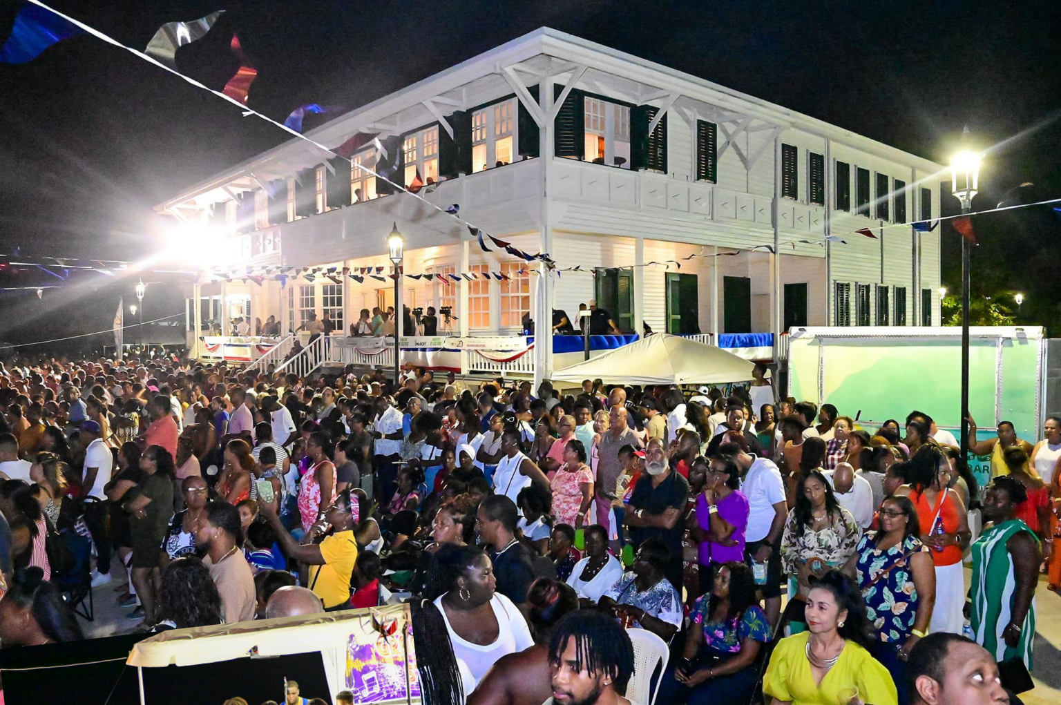
Pan Yaad, Old Government House, Belize City, September 2023