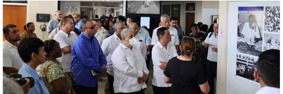
George Price Centre, Belmopan, January 2023