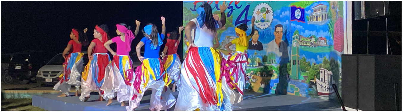
Earth Day at the Corozal House of Culture, Corozal Town, 2023