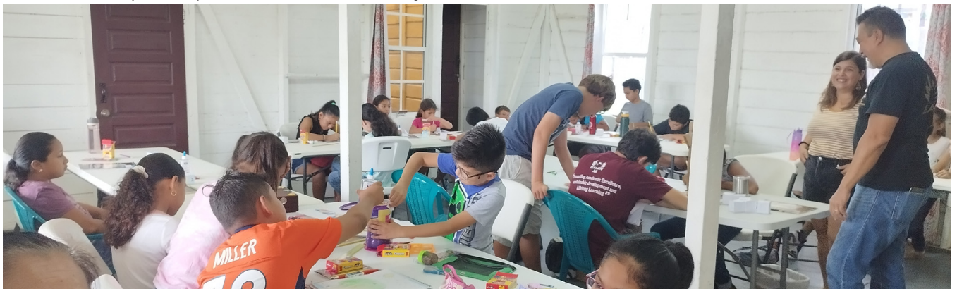
Galen Summer Program, San Ignacio/Santa Elena (SISE) House of Culture, 2023