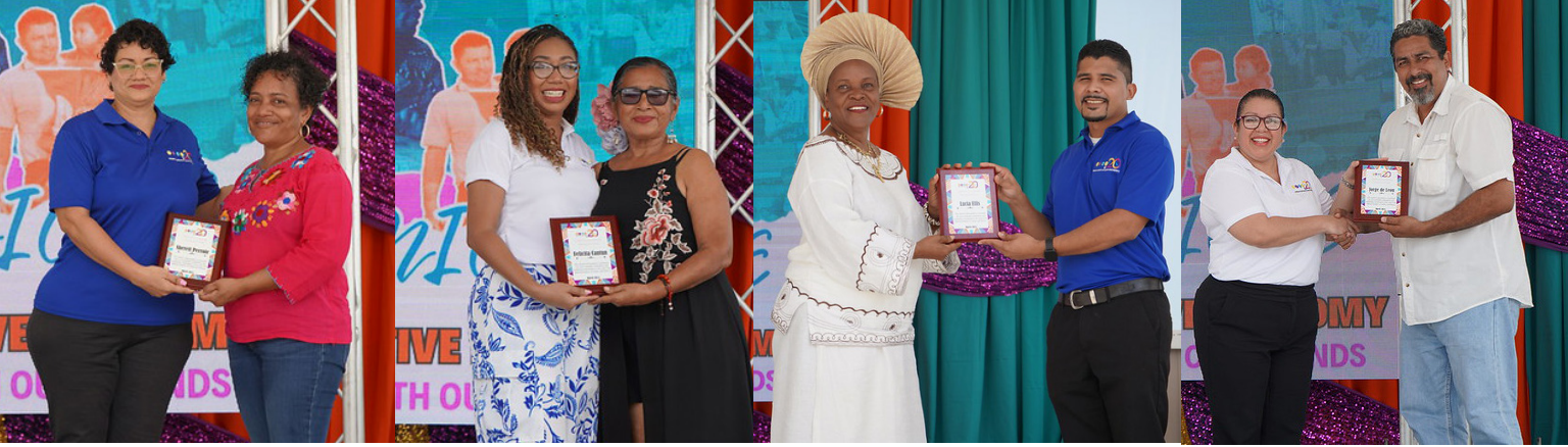
Celebrating 20 years at the NICH Stakeholders event , 1 March 2024