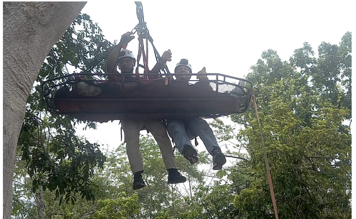
Actun Tunichill Muclal Cave training, May 2023. This workshop is a necessary training for tour guides to be aware of the regulations for the site and the safety measures they must take to ensure the wellbeing and welfare of the tourists that visit the site.