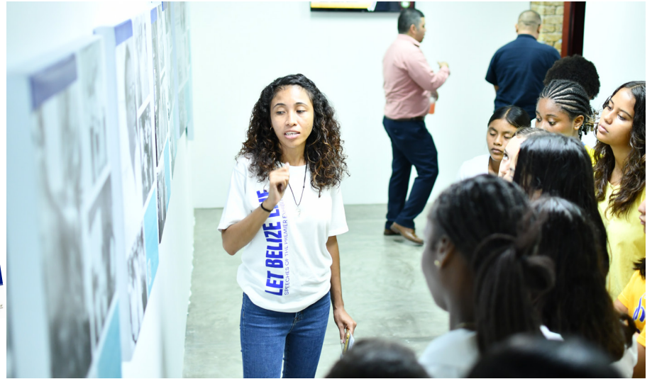
Museum of Belize, September 2023

Allow me now to reflect on the past year, and briefly outline a few of the significant actions and programs carried out by NICH.