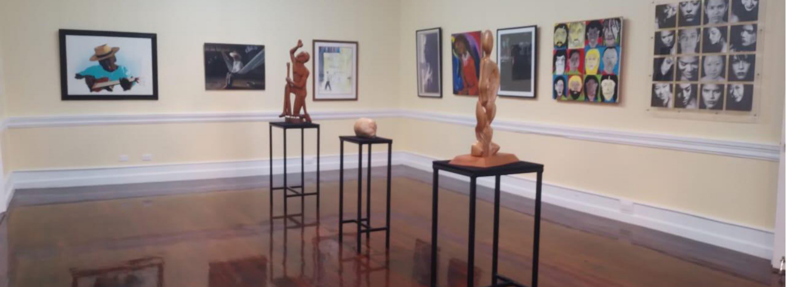
Museum of Belizean Art (MOBA) set to open 17 April 2024