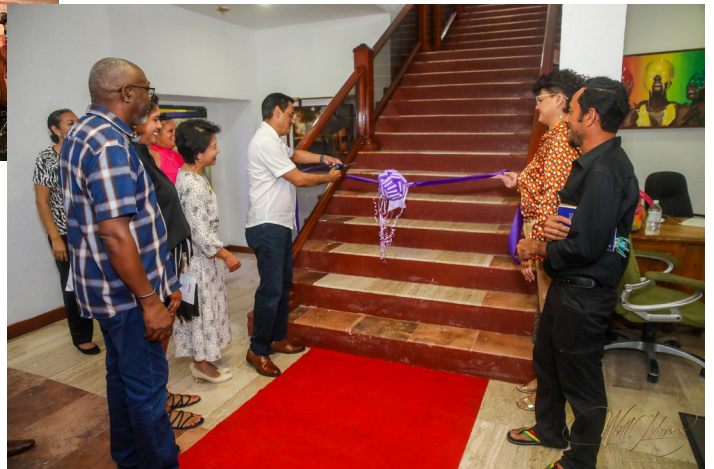
Women in Art 2024 - Painting In Pairs, a duo painting session for mothers, daughters, sisters, friends, and mentors (March 14), Womxn in Art exhibit launch (March 15) and Veranda Concert Series featuring Des and Chela (March 16)