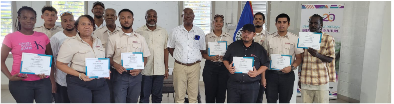
NICH training in fire fighting, communications and public relations, writing and security protocols Nov 2023