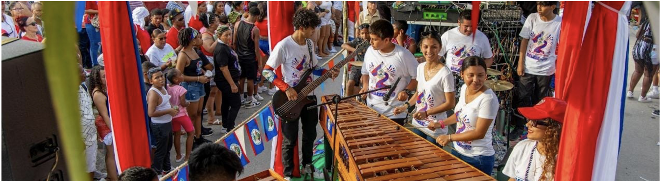
Marimba Group, Benque House of Culture, Cayo, 2023