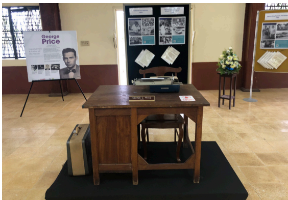
Punta Gorda Library, March 2023