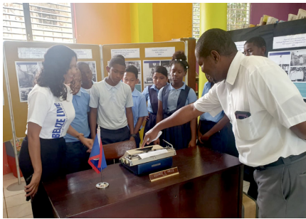
Ignacia Cacho Library, Dangriga, April 2023