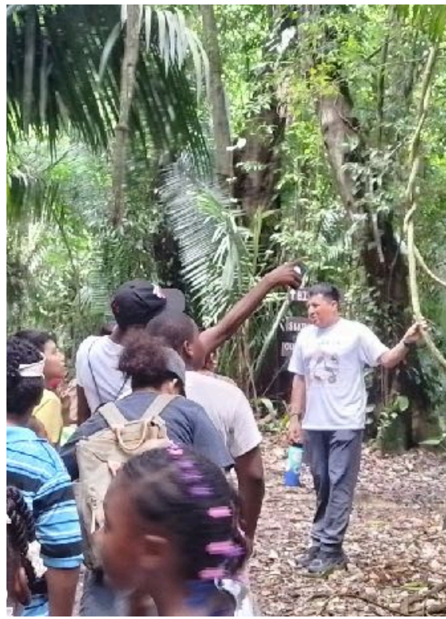
Birds of Belize Ornithology Camp