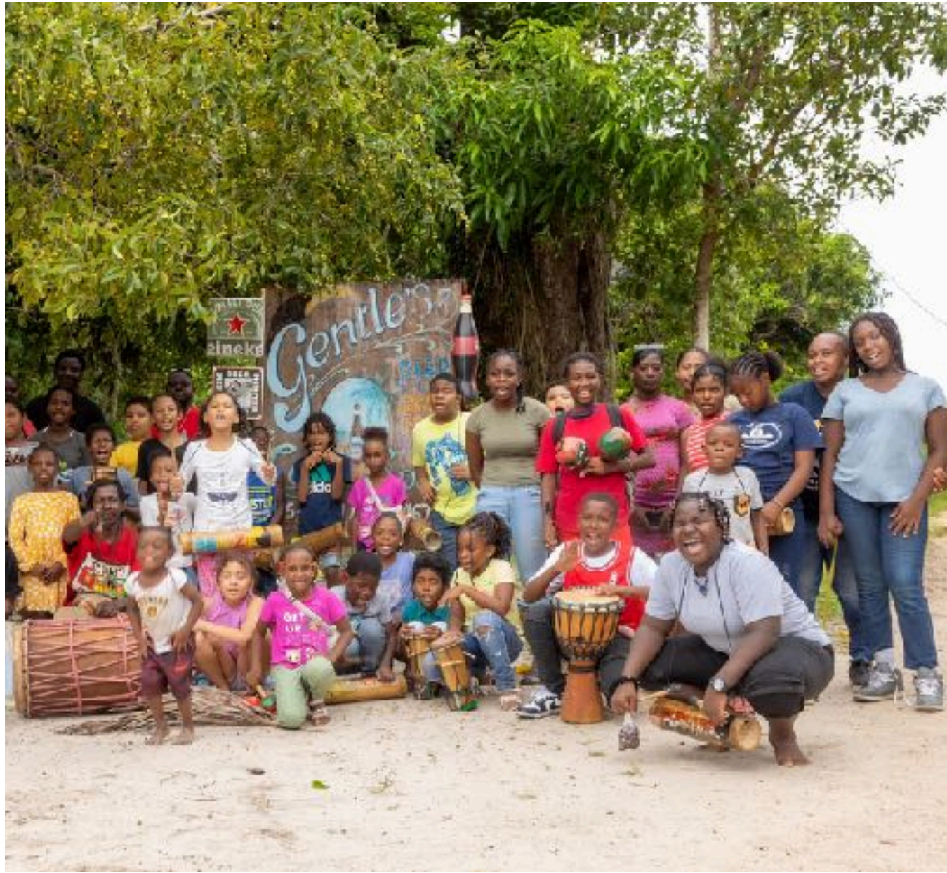
Marooners Kriol Kolcha Camp