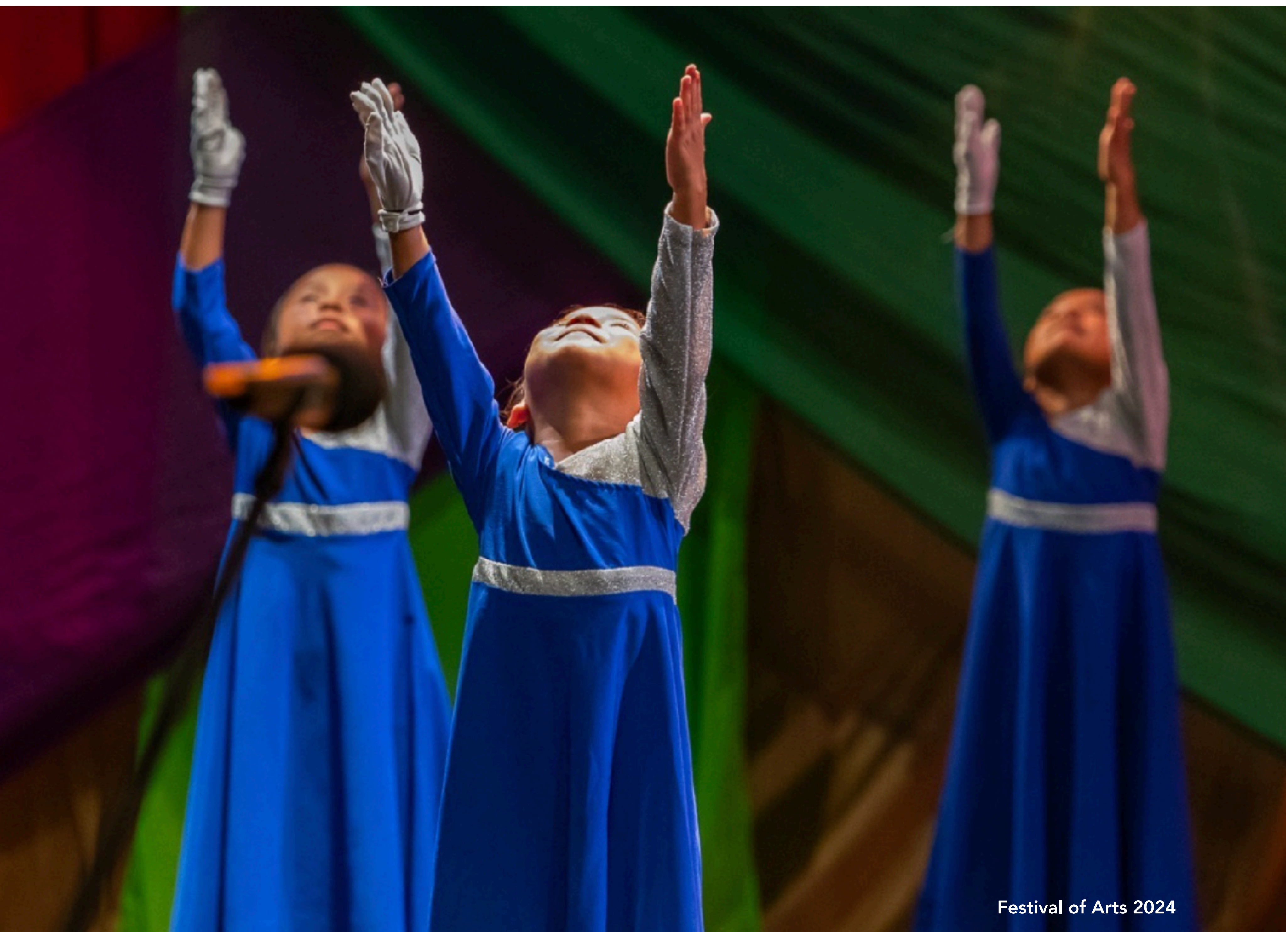
Festival of Arts 2024